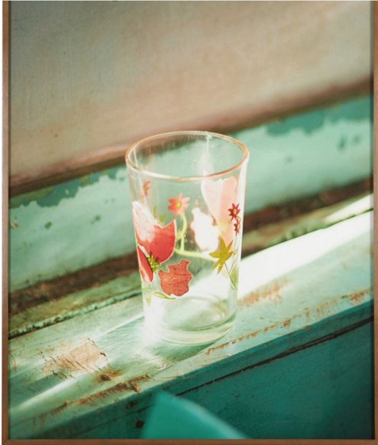
Dianne Rosario, 'I came like water and like wind I go', 2023 archival pigment print.